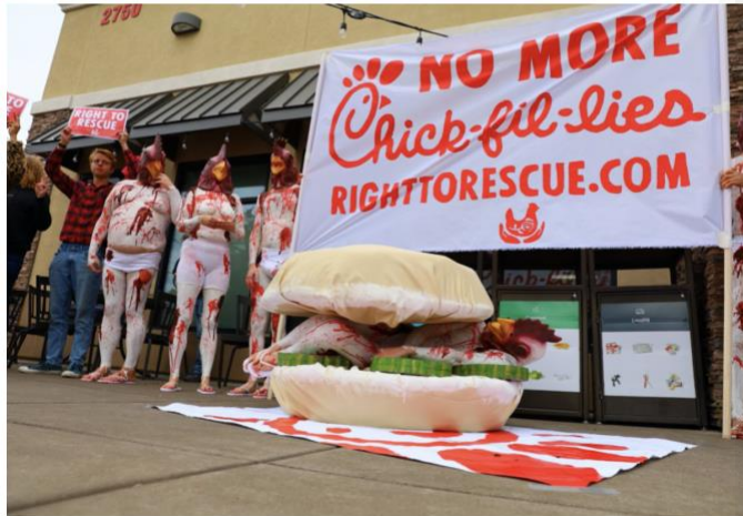
Protesters including some painted to resemble bloody chickens outside of the Walnut Creek Chick-Fil-A on Feb. 25, 2023.